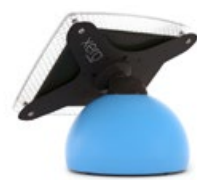
Shown in Dynamic Blue