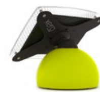
Shown in Fusion Green