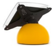
Shown in Sunkissed