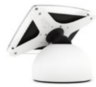
Shown in Sky White

The Armodilo Sphere (Xero) adds additional brandability to the award-winning design of the Sphere. Put your own unique finishing touches on any space with this playful and quirky desktop iPad or tablet powered kiosk, and take advantage of its customizability to personalize your interactive touchpoint or point-of-sale system. The unique base design of the Sphere (Xero) features the ability to be set up in either landscape or portrait mode, a full 90° range of motion for the perfect sharable screen and an optional 360° rotational base plate add-on. Wherever you place it and however you customize it the Sphere (Xero) invites the whole world to engage with you.