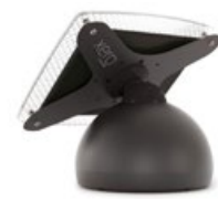
Shown in Gun Metal Grey