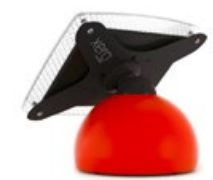
Shown in Daredevil Red