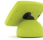
Shown in Fusion Green