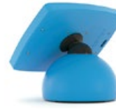
Shown in Dynamic Blue