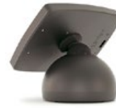
Shown in Gun Metal Grey