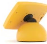
Shown in Sunkissed