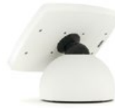
Shown in Sky White