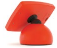
Shown in Daredevil Red